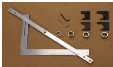
MODEL 7 INCLUDED ACCESSORIES SHOWN