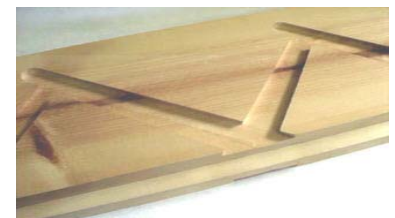
FINISHED STRINGER SHOWN